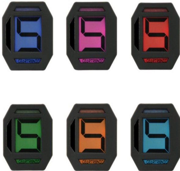
Various Backlight Colours available

This device will work with all gearbox types including sequential and H pattern and is suitable for cars, bikes and karts.